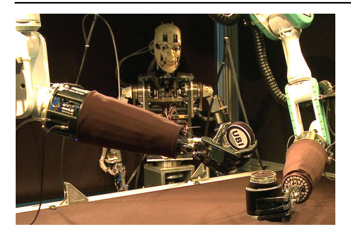
Fig. 5 Autonomous opening of the lid of a jar by a bi-manual anthropomorphic robot hand system