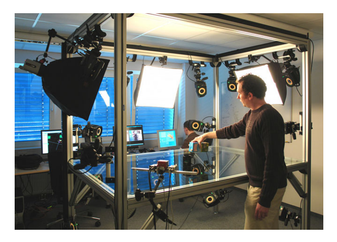
Fig. 1 Manual Intelligence Lab (MILAB)

Besides requiring the allocation of a larger number of degrees of freedom to the representation of the human hand, a manual interaction database should also include recordings of the position and orientation of involved objects, and can benefit from additional modalities recording interaction sounds, eye gaze data or information about tactile forces at the finger tips. This multimodality makes the design of a manual interaction database a highly non-trivial task that is intimately coupled with the design of suitable lab environment to actually capture the envisaged data. The Manual Intelligence Lab (MILAB) (see Fig. 1) currently supports a set of eight devices and these are listed, along with their specifications, in Table 1. This allows us to observe manual interactions at a high level of spatio-temporal resolution.